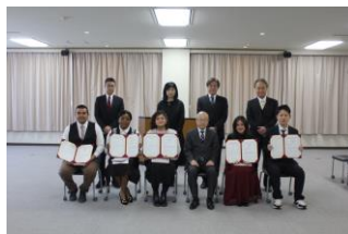
[ Teacher Training Student Completion Ceremony ]