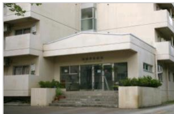
[ International House ]