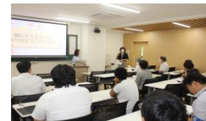
[ Presentation of Research Result ]

Although it varies depending on their academic supervisor, students will generally receive thesis guidance from their supervisor once a week, lectures on approximately 4 subjects per week (including supplementary Japanese language classes), and practice at school approximately two days per week. At the time of completion, students will be required to present the results of one year research under the guidance of their academic advisor and Japanese language instructors, and submit a completion report (approximately 30 pages).