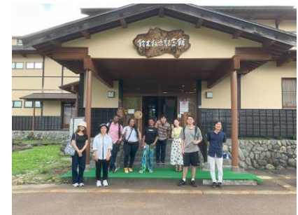
[ Japanese Culture and History Experience ]