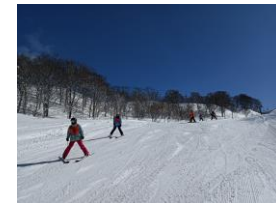
[ Ski Experience ]